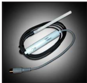
Pencil Probe (P8M05S8A 8 MHz)

Lightweight & Portable ... Document Results