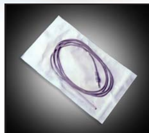
Single-Use (VDP-8 8 MHz)