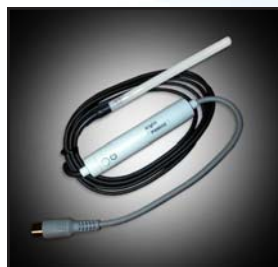
Pencil Probe (P8M0558A 8 MHz) * also available in 5 & 10 MHz

Koven Technology, Inc. Your Vascular Healthcare Partner