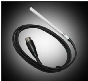
Pencil Probe (PP8M05N5A 8 MHz) * also available in 10 MHz

Lightweight & Portable ... Bidirectional Flow Assessment