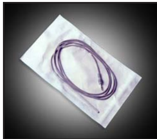
Single-Use (VDP-8 8 MHz)